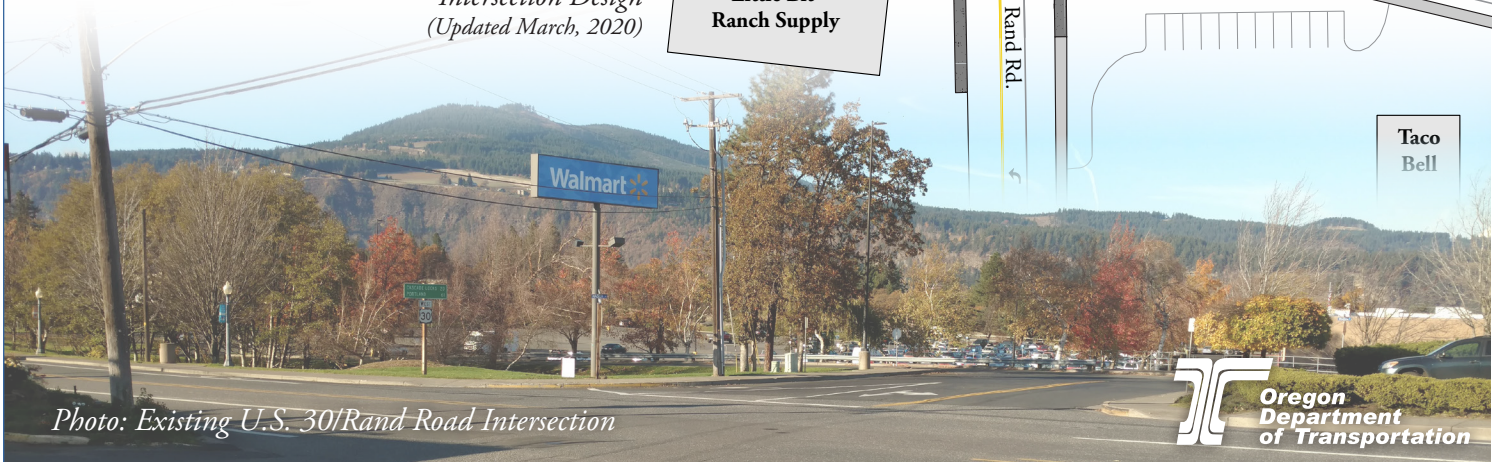
Photo: Existing U.S. 30/Rand Road Intersection